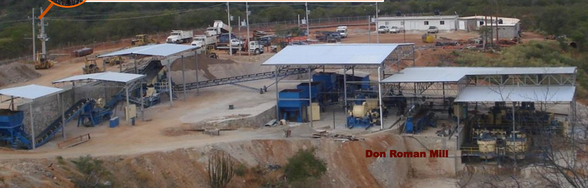
Don Roman Mill