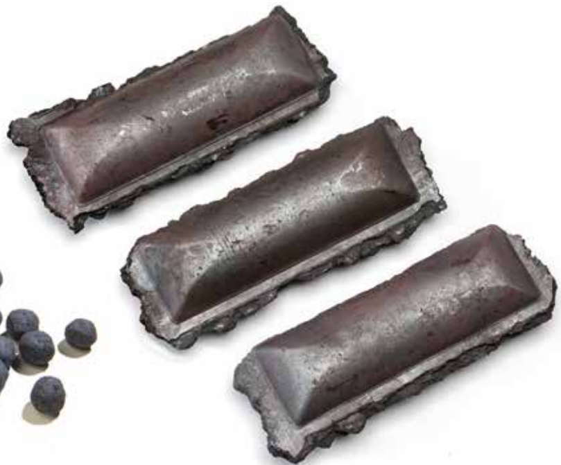
Hot Briquetted Iron (HBI)