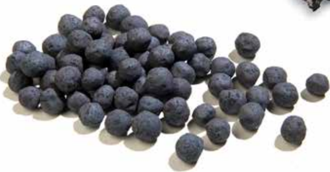
Iron Ore Pellets

Cleveland-Cliffs is completing the construction of its first HBI production plant in Toledo, Ohio, which will begin production in June 2020. The most modern, efficient and environmentally compliant direct reduction plant in the world, Cleveland-Cliffs will be the first producer of high-grade, ore-based metallics in the U.S. Great Lakes region. The HBI will be a compacted form of DRI in the shape of briquettes designed for ease of shipping, handling, and feeding into electric arc furnaces. Electric-arc furnace (EAF) steelmakers will be able to domestically source feedstock and move up the value chain by producing sophisticated steel products. HBI can also be used in blast furnaces, helping boost their productivity.