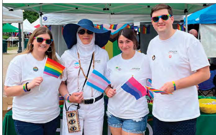
Some of our Voices of Pride LGBTQIA+ ARG members supporting Kalamazoo, Michigan Pride Event

Horizon introduced Advisor Resource Groups in 2021 to promote inclusion and diversity throughout the company. These voluntary groups are open to all advisors to foster an affirming environment and assist with educating and recruiting advisors, community outreach as well as identifying unique opportunities to assist the communities we serve.