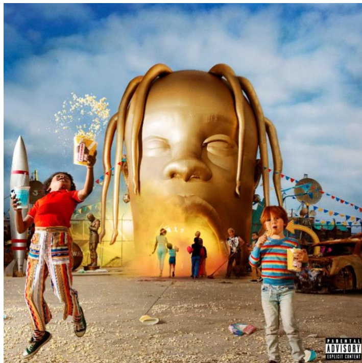
Travis Scott ASTROWORLD

Tuesday, November 13, 2018 - Atlanta, GA @ Philips Arena Thursday, November 15, 2018 - Dallas, TX @ American Airlines Center Monday, November 19, 2018 - Louisville, KY @ KFC Yum! Center Wednesday, November 21, 2018 - Toronto, ON @ Scotiabank Arena Saturday, November 24, 2018 - Newark, NJ @ Prudential Center Sunday, November 25, 2018 - Pittsburgh, PA @ PPG Paints Arena Tuesday, November 27, 2018 - New York, NY @ Madison Square Garden Thursday, November 29, 2018 - Washington, DC @ Capital One Arena Friday, November 30, 2018 - Hartford, CT @ XL Center Saturday, December 1, 2018 - Philadelphia, PA @ Wells Fargo Center Sunday, December 2, 2018 - Boston, MA @ TD Garden Tuesday, December 4, 2018 - Cleveland, OH @ Quicken Loans Arena Wednesday, December 5, 2018 - Detroit, MI @ Little Caesars Arena Thursday, December 6, 2018 - Chicago, IL @ United Center Saturday, December 8, 2018 - Minneapolis, MN @ Target Center Sunday, December 9, 2018 - Milwaukee, WI @ Fiserv Forum Monday, December 10, 2018 - Omaha, NE @ CenturyLink Center Omaha Wednesday, December 12, 2018 - Denver, CO @ Pepsi Center Saturday, December 15, 2018 - Sacramento, CA @ Golden 1 Center Tuesday, December 18, 2018 - Phoenix, AZ @ Talking Stick Resort Arena Wednesday, December 19, 2018 - Los Angeles, CA @ The Forum