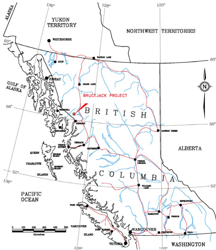
Property Location Map

We acquired our 100% outright interest in the Brucejack Project in December 2010, pursuant to the Acquisition Agreement with Silver Standard. The Brucejack Project is subject to a 1.2% net smelter returns royalty in favour of Franco-Nevada Corporation (“ Franco-Nevada ”) on production in excess of 503,386 ounces of gold and 17,907,080 ounces of silver.