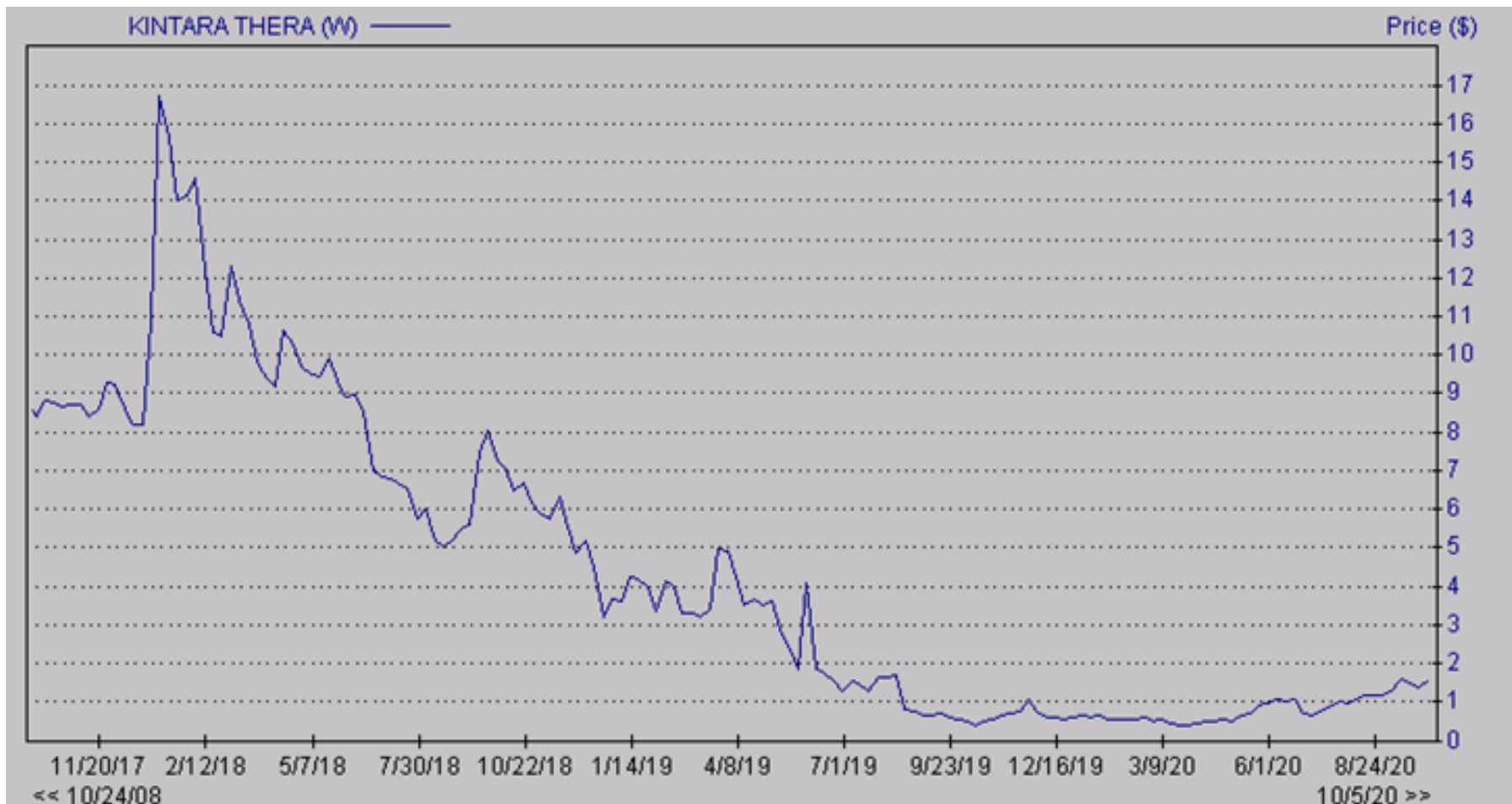
Kintara Therapeutics, Inc. – Share Price Chart 4