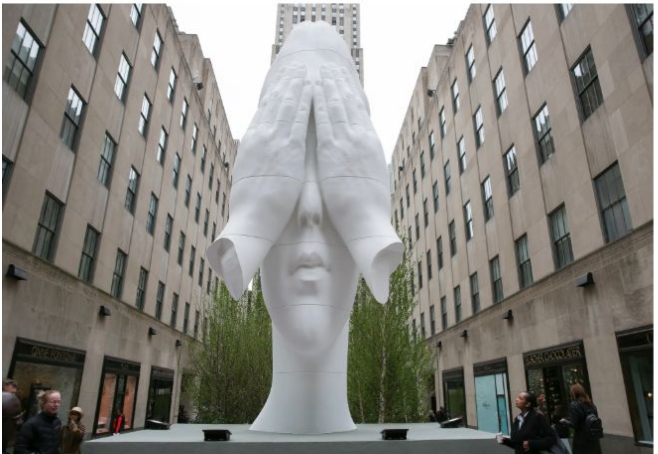
Jaume Plensa's "Behind the Walls" sits facing Fifth Avenue, as part of Frieze Sculpture at Rockefeller Center.

Frieze New York and TEFAF are a bit pricey, but looking is free (or nearly) at Frieze Sculpture at Rockefeller Center and alternative fairs in Brooklyn and Manhattan.