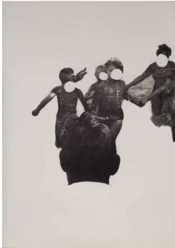
Pawl Mendrek ARIADNE Drawing ($1890)

A haunting photograph of a two-lane road surrounded by forest trees engulfed in fog, this work is dark, yet beautiful. Surely, it reminds BLL fans of all the times the series shows characters driving along stretches of highway while captivating music plays in the background.