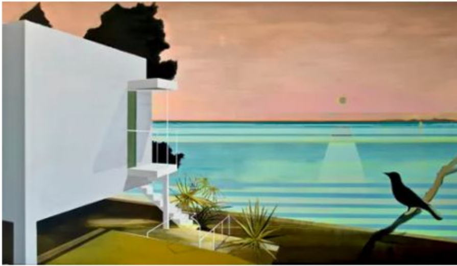
Cécile van Hanja Blackbird Painting ($3950)