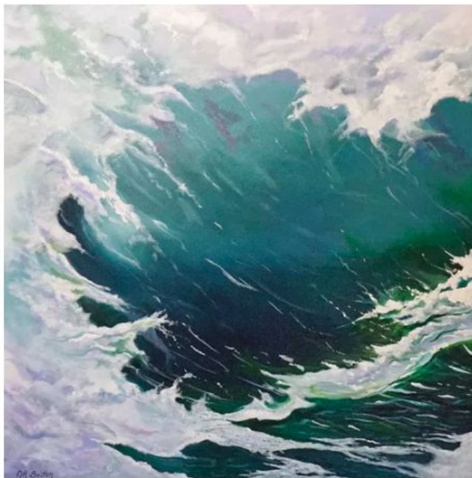
Donald Britton Pacific Spa Painting ($4550)