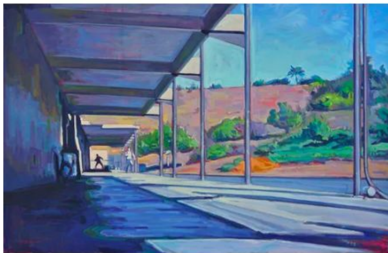
Benjamin Gaboury San Clemente High School Painting ($2610)

What could be more evocative of the Monterey, California setting of Big Little Lies than a painting of a wildly crashing wave in the Pacific ocean? The tight frame of the work makes you feel like you're right there, swimming in the water, about to be taken over by the wave.