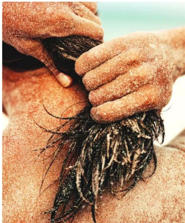
Michael Haber Sandy Hands Limited Edition of 8 Photograph ($2850)

If you just can't get enough Big Little Lies , consider purchasing one of these paintings, drawings, or photographs to bring the series into your home. Keep scrolling to take a look at the special collection all BLL fans are sure to appreciate. Spoiler alert: It's equally as refreshing for those who are yet to binge the HBO favorite.