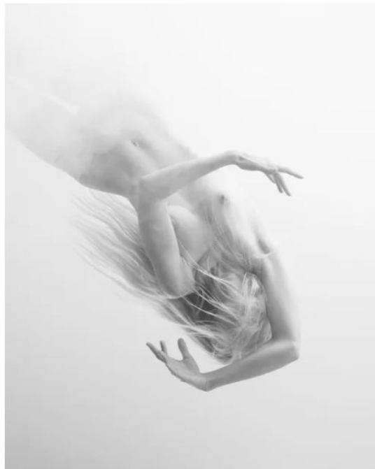
Ransom and Mitchell Entwine Limited Edition 1 of 10 Photograph ($1600)

It's no secret how this photograph of Big Sur ended up in a collection of art inspired by BLL . A soft morning light bounces off the ocean as it calmly traces the coastline. It's a beautiful scenic image not unlike many included in the HBO series.