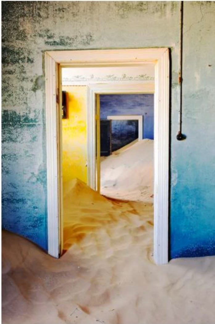
Pieter Geevers Kolmanskop Fine Art Print Limited Edition Photograph ($930)